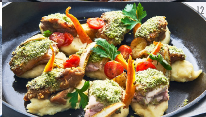
7. Ayam Panggang

(Balinese Grilled Chicken with Torch Ginger, Lemongrass and Shallot Sambal)