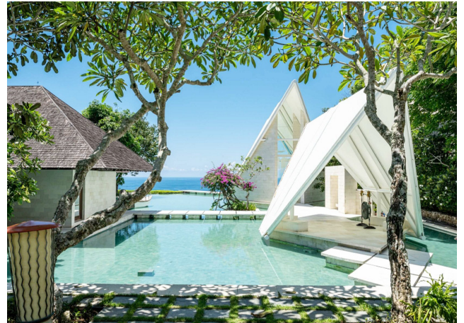
Chapel Wedding / Seating Capacity 70pax