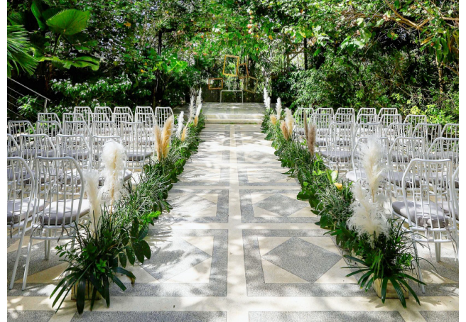
Garden Wedding / Seating Capacity 100pax