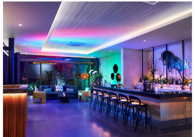
After Party Room / Lower Floor