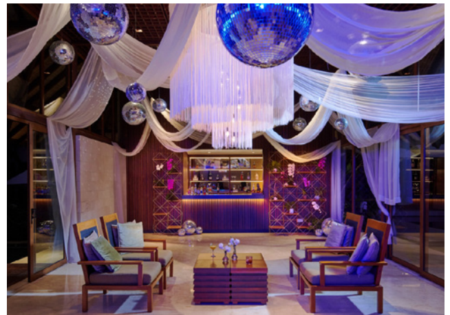
After Party Room