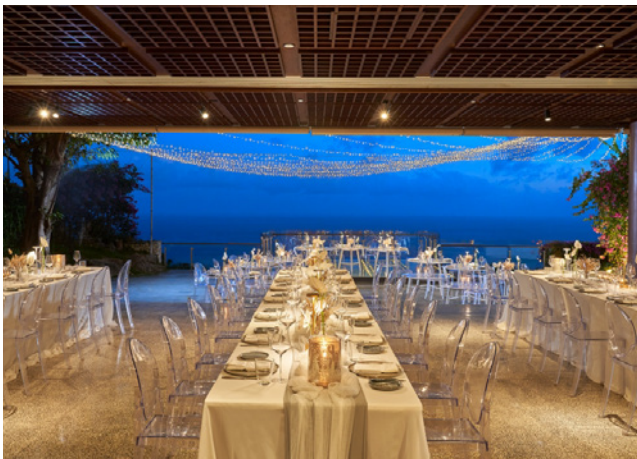
Earth / Lower Floor