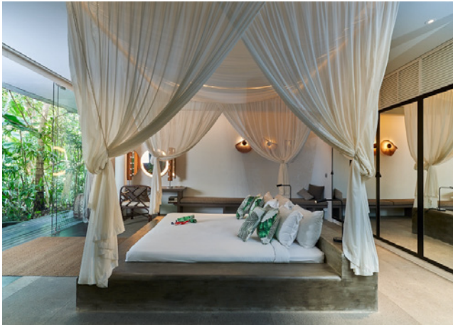
Preparation Suites / Master Bedroom