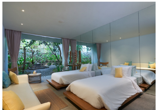
2 Guest Bedrooms