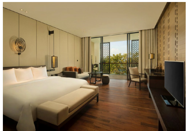
3 Deluxe Rooms