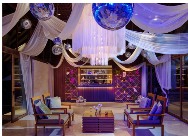
After Party Room