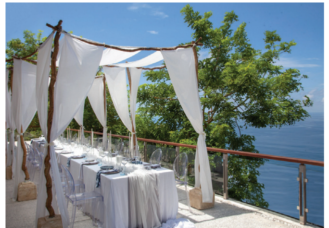
Open Terrace / Upper Floor