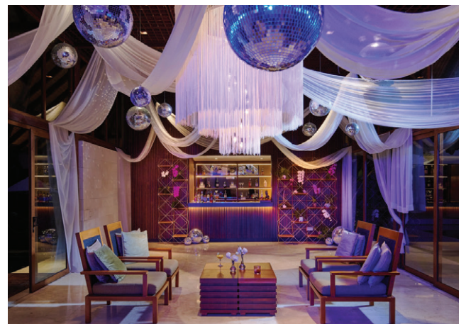
After Party Room