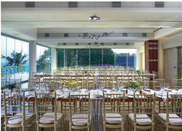
Heaven / Upper Floor