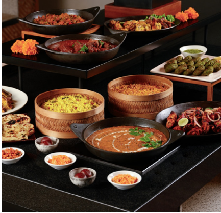
Indian Asian Buffet