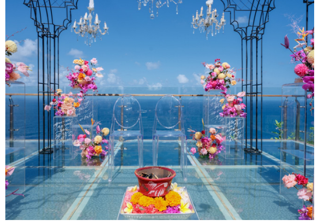
Air Wedding / Seating Capacity 250pax