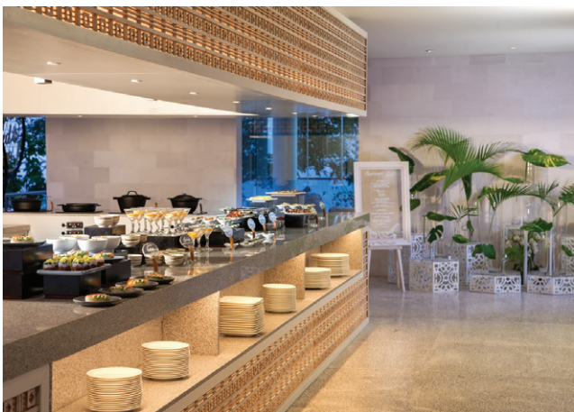
Heaven / Buffet Area