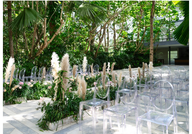
Garden Wedding / Seating Capacity 100pax