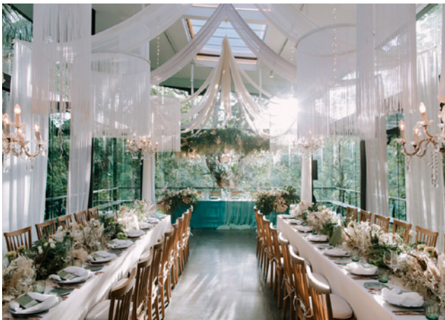
Plumeria Room / Upper Floor