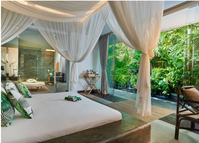
Preparation Suites / Master Bedroom