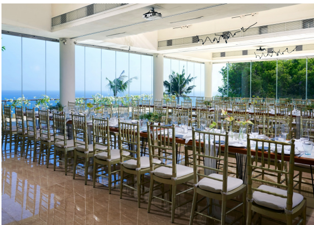
Heaven / Upper Floor