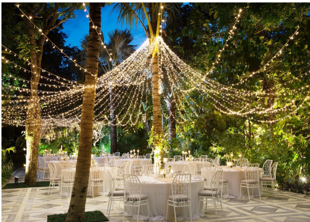
Moonlight Garden / Lower Floor