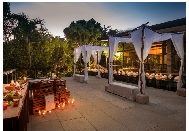
Pool Terrace / Upper Floor